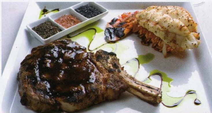
Australian Lobster Tail and Envy's Signature Prime Bone-in Rib Eye with Basil Oil and Reduced Demi Glace is pictured with (from left to right): Salish Northwest Alder Smoked, Alaea Red Hawaiian Clay, and Hawaiian Black Lava.

Pure White Himalayan Sea Salt, it's very neutral and doesn't change the flavors of the food.