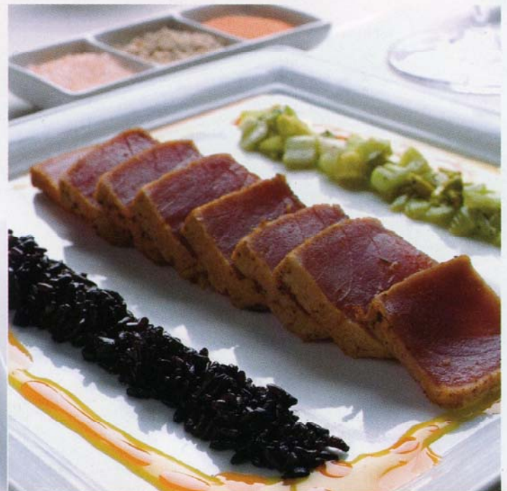
Seared Ahi Tuna with Black Emperor Rice and Baby Bok Choy is accompanied by (from left to right): Bolivian Rose, Bali Coconut & Lime Smoked, and Alaea Hawaiian Red Clay.

I don't think so. I was always told from the time I started cooking at 15 or 16 that salt is the king of the kitchen. □