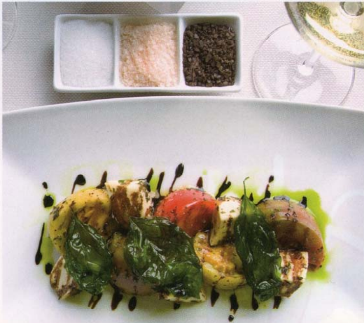
Fresh Buffalo Mozzarella Salad with Heirloom Tomatoes and Fried Basil is paired with (from left to right): Pure White Himalayan, Murray River Flake and Salish Northwest Alder Smoked.